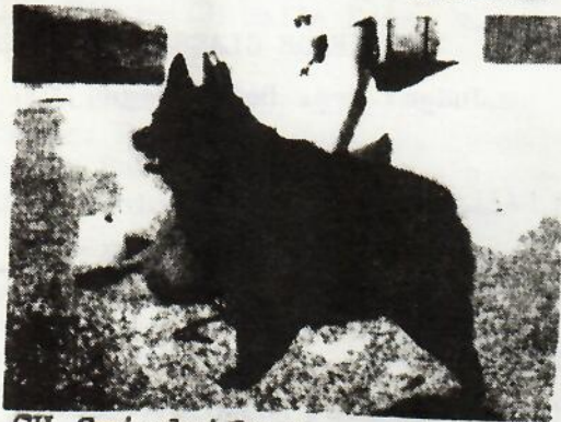
CH Spindrift Beau N' Eros At Stud to Approved Bitches