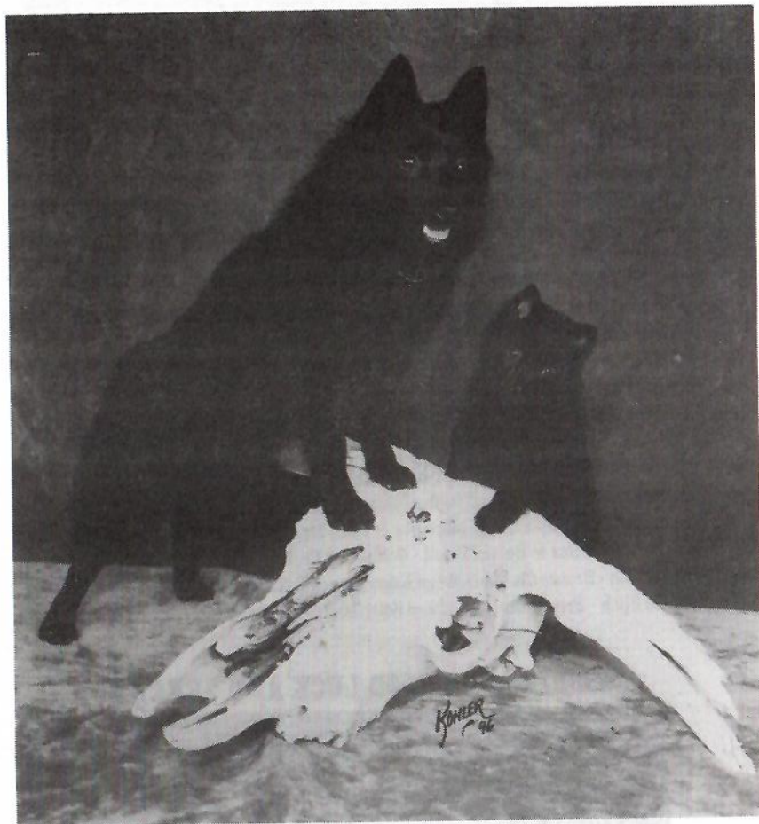
CH SCHIPADOX SHOWTIME (finished at 8 mo. with 4 majors) and his baby sister SCHIPADOX JOHNIE FORGET ME NOT

Congratulate their sire MULTI-BISS, AM., CAN., MEX., INT'L C.A.C.I.B. CHAMPION BLUE MAX'S JOHNNY-JUMP-UP