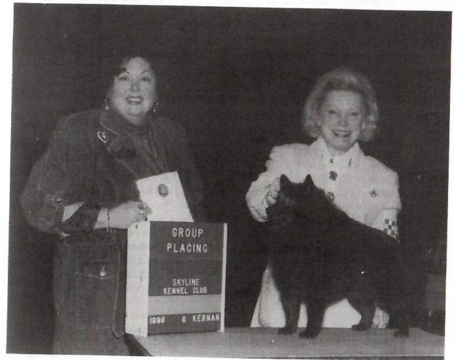
CH. Nanhall's Tres Bien