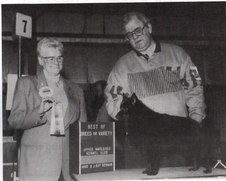
CH. Nanhall's Chi Chi