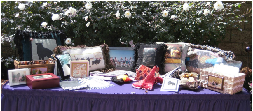
Trophies & Gifts