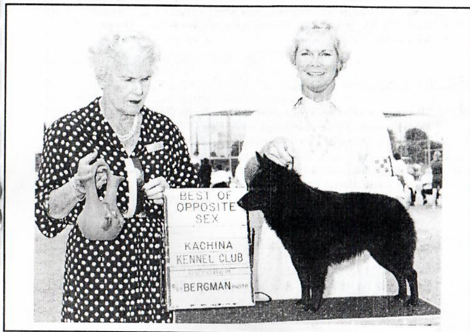
CH Schip-By-Me Pancho Barnes

Wishing all of our friends and fellow breeders the same measure of success and enjoyment that we have been privileged to enjoy in 1993.