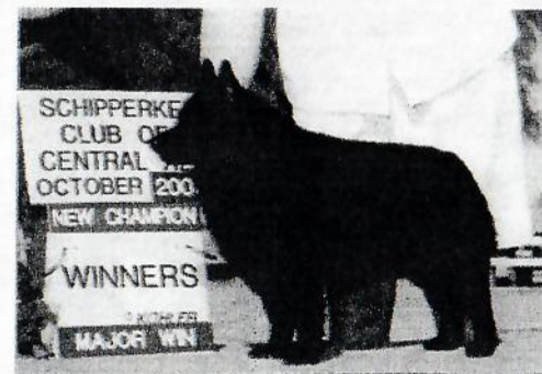
Ch. Willow's Razzmataz (Ch. Barbil Jacksonville Jazz X Ch. Willow's Whispering Secrets)

Willow Schipperkes Breeding, above all, for Health and Temperament