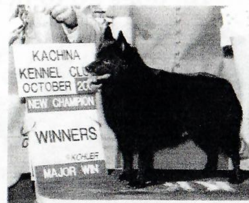
Ch. Willow's Whispering Secrets (Ch. Daradan's Sky King O'Blue Max X Ch. Kleingaul's Girl on the Move)