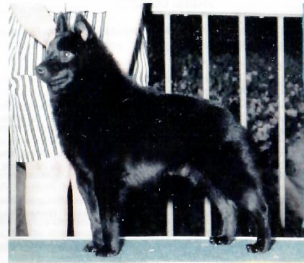
Champion Spindrift Flashfire "Blaze" 1994 - 2005

We are grateful to God for having given us the pleasure of these beautiful Schipperkes to brighten our lives. We remember each we've lost ... enjoy those which are still with us ... and look forward to those yet to come.