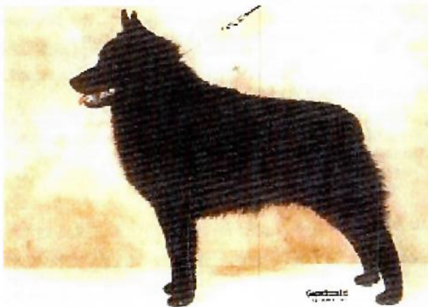
CH. Spindrift A Fire In Winter At stud by Private Treaty