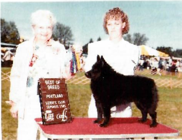
CH. Spindrift Sarahtoga Scamp, inbred son of Sarahtoga, in 1985. STYLE and CLASS continues