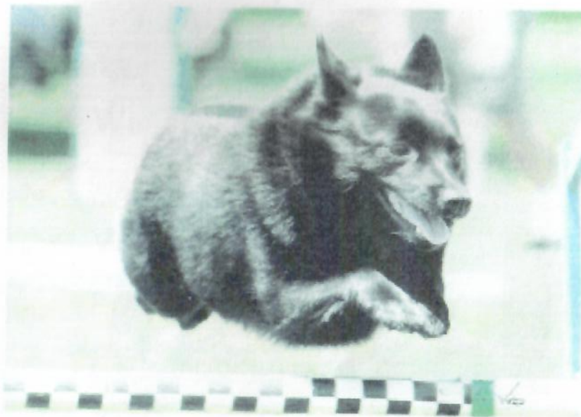
AKC CH / Int'l CH DeLamer's Wicked Black Beach OA, NAJ, RN, CGC, TDI