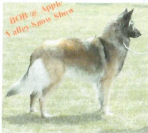
Victoria D'Sang Bleu