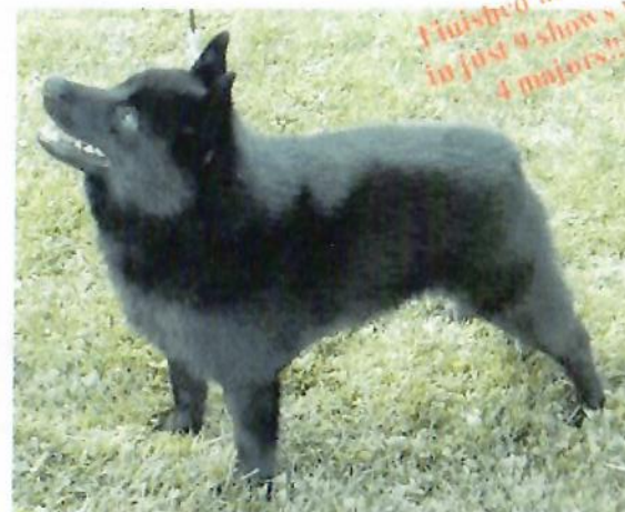
Willow's Spindrift Stowaway

Finished at 12 mos in just 9 shows with 4 majors!!!