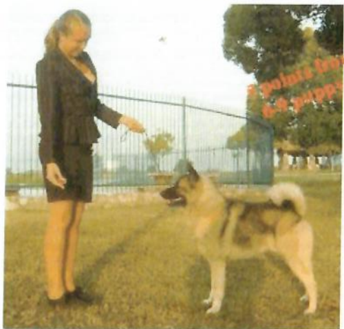
Marbri's Gunsmoke AV Telggren